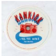
Yes, Yes Suite 3 (7" Single) Released: July 2006