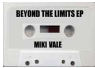
Beyond the Limits EP (Limited Edition) Released: 1996 out of print