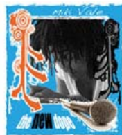
The New Dope (CD Single) Released: Winter 2006