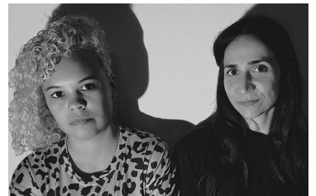
MIX304: Black Girl / White Girl